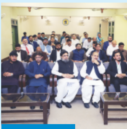
Corporate Advisory Council Meeting