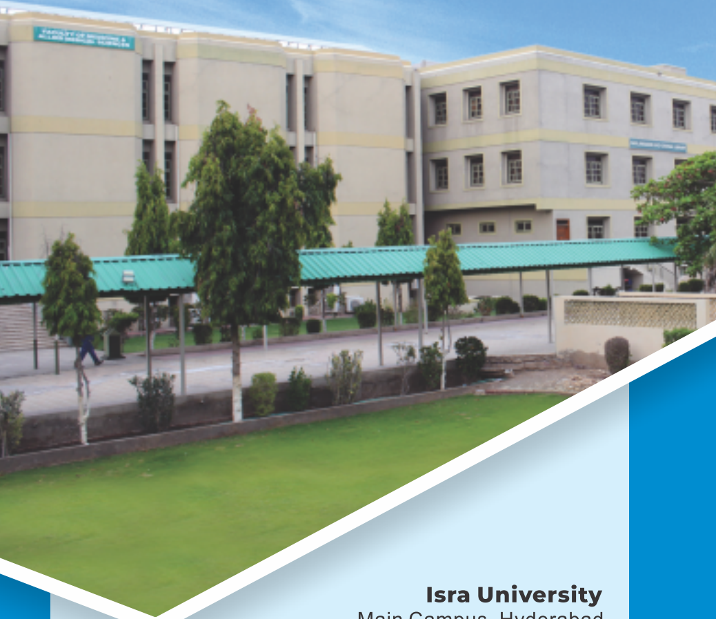
Isra University Main Campus, Hyderabad