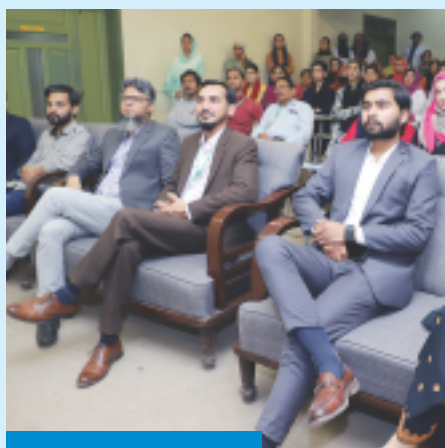
Session on "Entrepreneurship & Success Story of Entrepreneur"