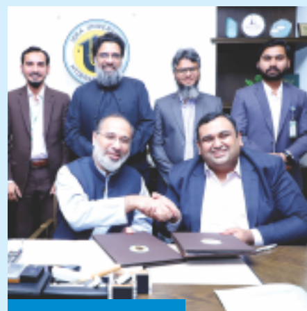
Mou Between Isra University And LMKT